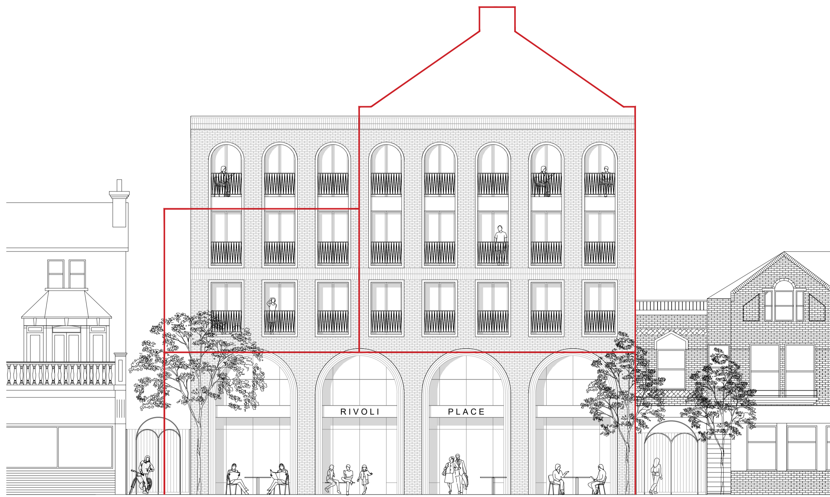
Proposed South Elevation 1:100 0 1 2 3 4 5